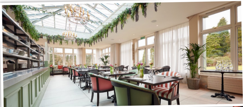
Well played: The light-filled restaurant and, below, cosy lounge

Kim unveils ace results of luxury hotel's makeover