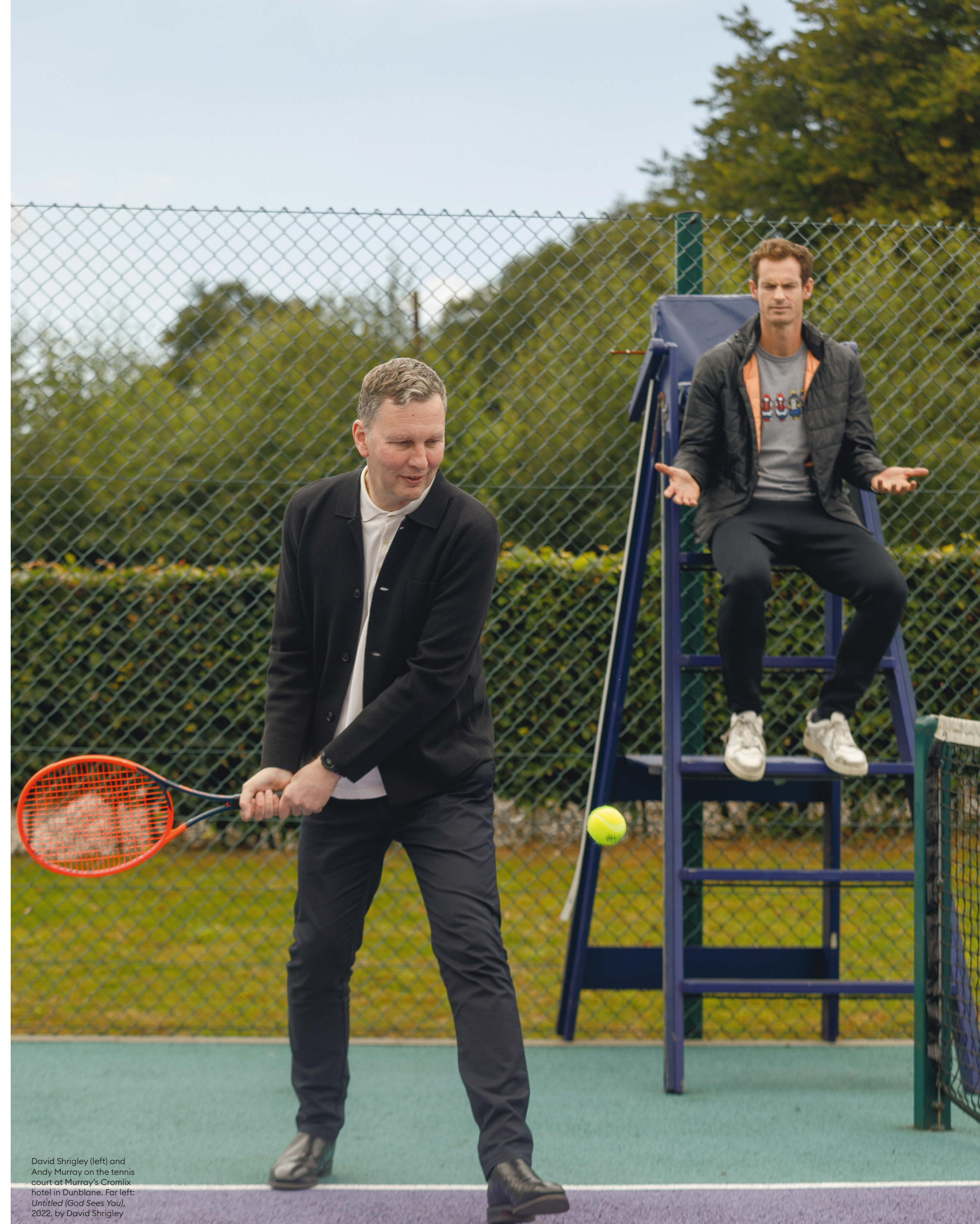
David Shrigley (left) and Andy Murray on the tennis court at Murray’s Cromlix hotel in Dunblane. Far left: Untitled (God Sees You) , 2022, by David Shrigley

PHOTOGRAPH: DAVID SHRIGLEY; FROM GET YOUR SHIFT TOGETHER BY DAVID SHRIGLEY (CHRONICLE CHROMA, £26)